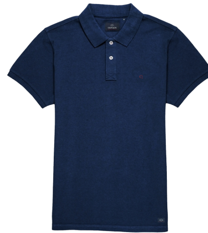
PIQUE SOLID 41154 MARINE

POLO CHEST EMBRO, SIDE WOVEN LABEL, 2 BUTTONS PLACKET