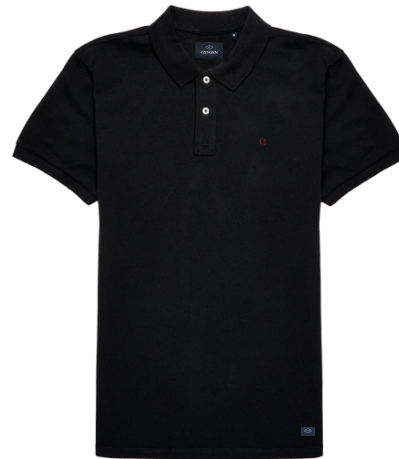
PIQUE SOLID 41154 BLACK

POLO, HEM WOVEN LABEL, 2 BUTTONS PLACKET