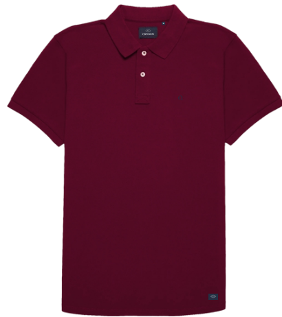
PIQUE SOLID 41154 MAGENTA