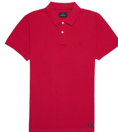
PIQUE SOLID 41154 RED