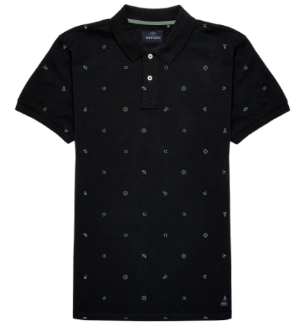
PIQUE ALL OVER PRINT 41162 BLACK

POLO CHEST EMBRO, SIDE WOVEN LABEL, 2 BUTTONS PLACKET